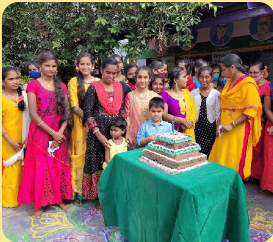
New Year's Day celebrations