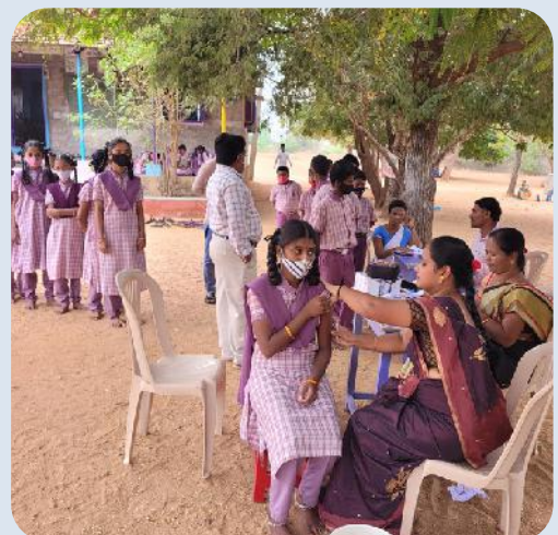
Vaccination programme between the age groups of 11 and 14 years.