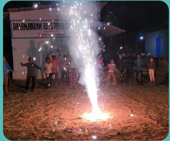
Celebrations of Diwali festival